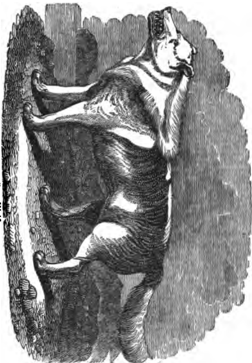
American Gray Wolf.